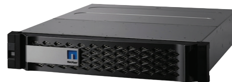
NetApp E5700 32Gb FC Storage