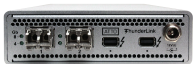
TLFC 2082 Thunderbolt™ 2 to Dual Port 8Gb Fibre Channel