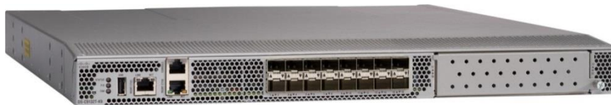
Figure 2 Cisco MDS 9132T 32-Gbps 16-Port fibre channel port expansion module