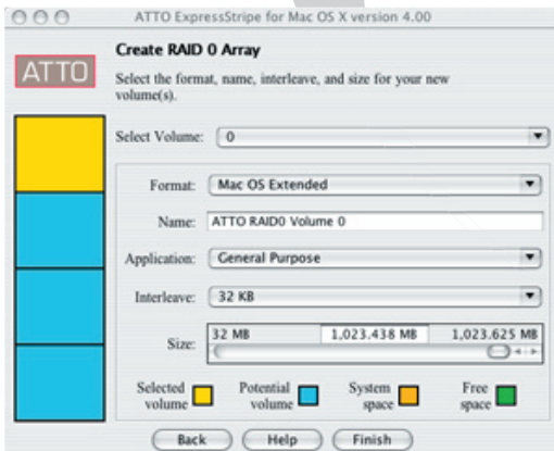
Figure 1 - Creating RAID 0 volumes

Data has been striped (Striped Volume 2) across LP4, LP5, and LP6. LP8 is a Standard volume using one partition and LP9 + LP10 is a Standard volume using two partitions. Physical Drive 4 is a free partition that can be used to create Standard or RAID 0 (Striped) volumes.