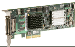
ATTO ExpressPCI UL5D LP