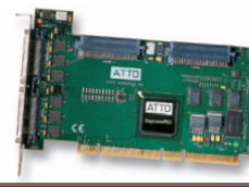
ATTO ExpressPCI UL4D